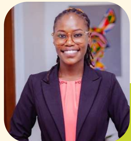
FLORIDA EDGAR TANZANIA

These efforts not only enhanced the community's environment but also fostered a sense of responsibility among residents. By repurposing waste into reusable items such as charcoal and decorations, we've promoted sustainable practices. Guided by our motto, "It begins with you; Africa is our business," the project demonstrates how collective action can create lasting, positive change.