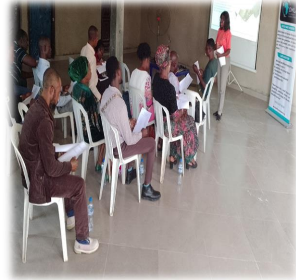
OMLA Club Supervisors Shine at the Orientation Program. Building A Thriving Club Ecosystem

No voyage is complete without a map! With a comprehensive overview of club policies, resources, and procedures, supervisors navigated the ins and outs of registration, communication, and student safety. We ensured they feel confident and empowered to tackle any challenge that may arise.