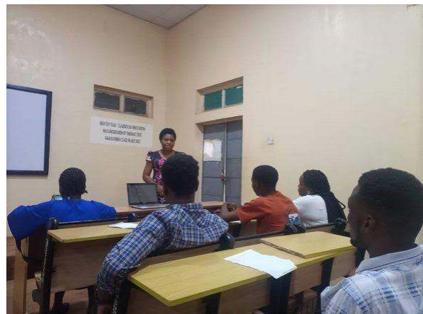
OMLA 2023 FELLOWS TRAINING THEIR OMLA STARS