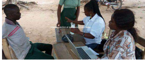
Interivew and Screening